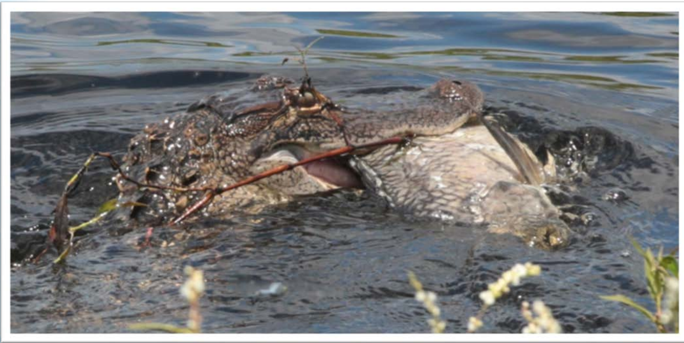
An alligator makes a meal out of a tilapia in the KRRP Phase I restoration area floodplain (5/7/2015)