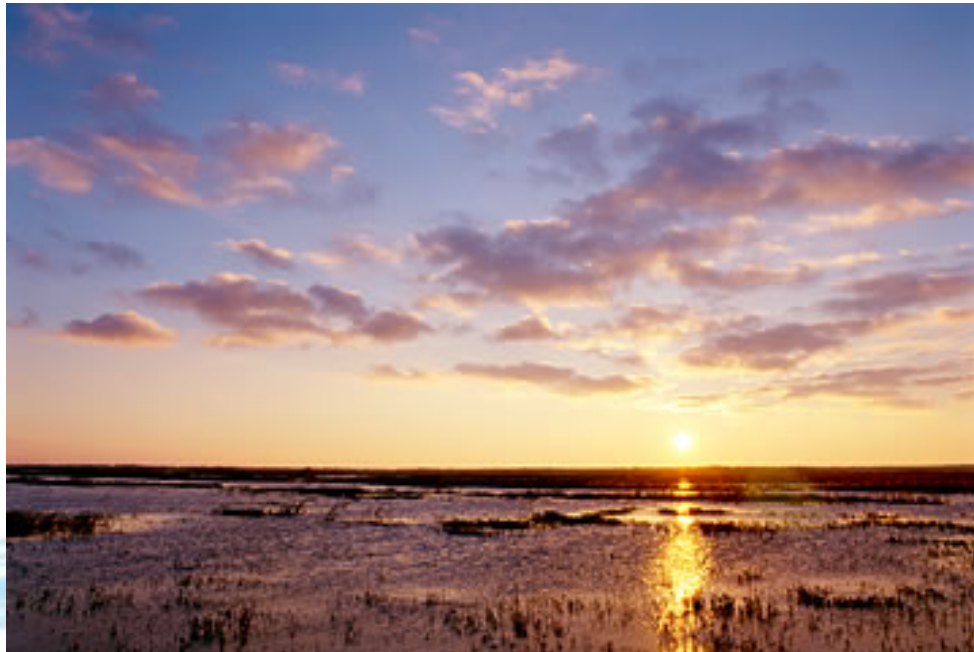
Lake Jesup Conservation Area, SJRWMD