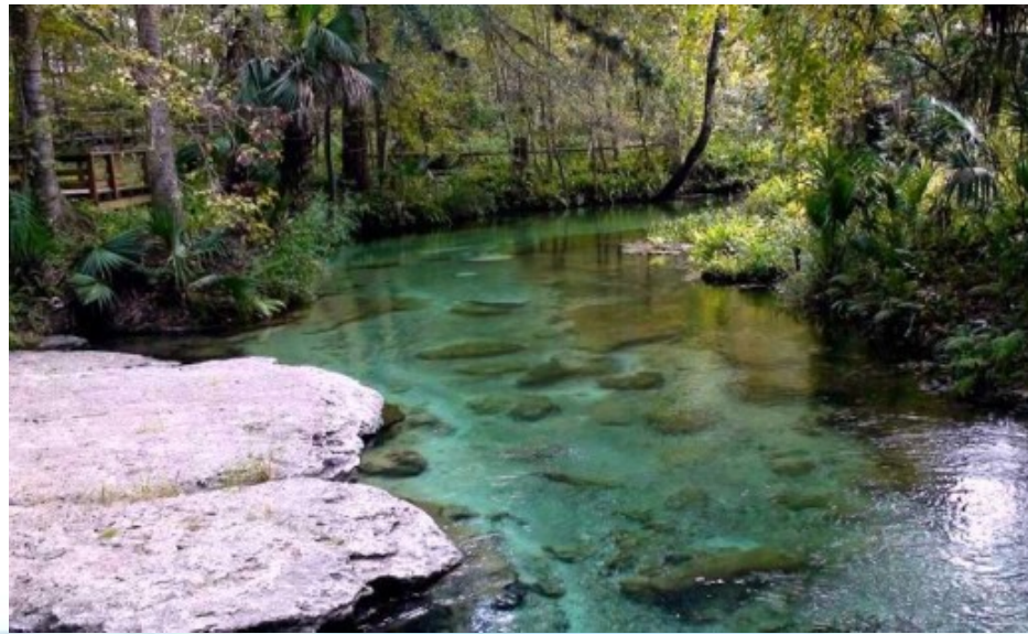
Kelly Park / Rock Springs